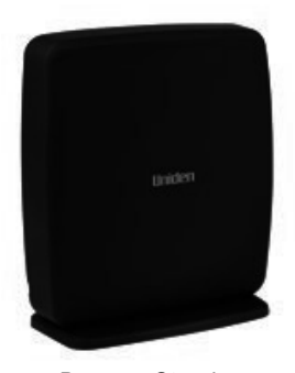
Base on Stand

DECT 1730 series base with cordless handset.