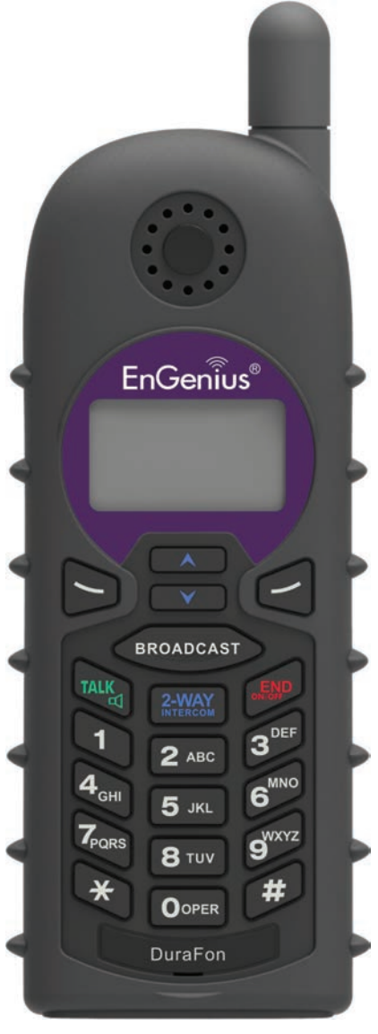
DuraFon SIP Handset